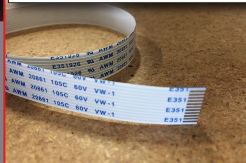
PT-1320-PE021 | EIB / Main Board Cable