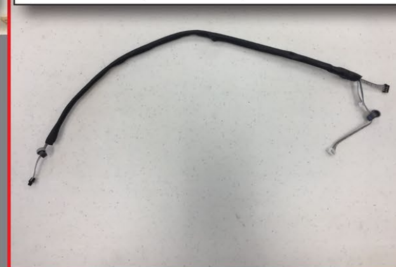
PT-A-1295 | 1800z Cap. Station Cable