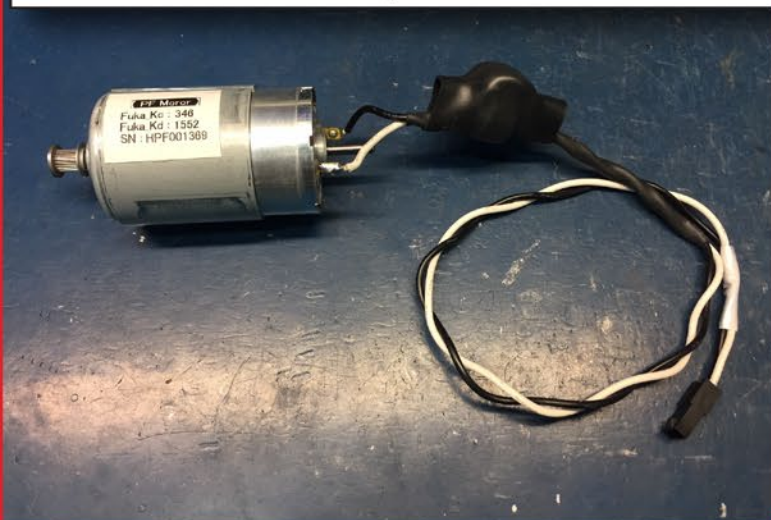
PT-A-1299 | CR Motor