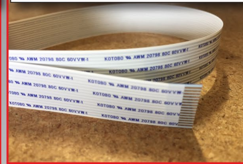
PT-1320-E098 | CSIC / Decoder Cable