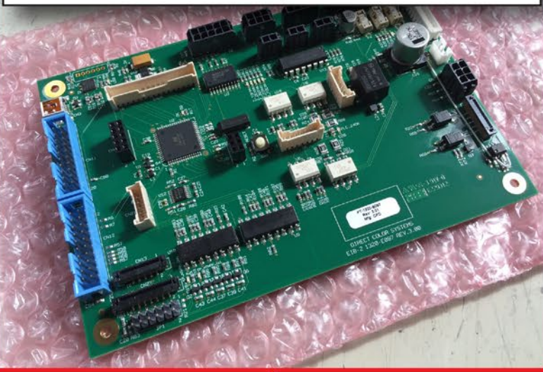
PT-1320-E097 | EIB2 Board