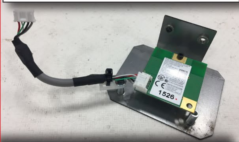
PT-1320-M298-EZ | WIFI Mounting Bracket