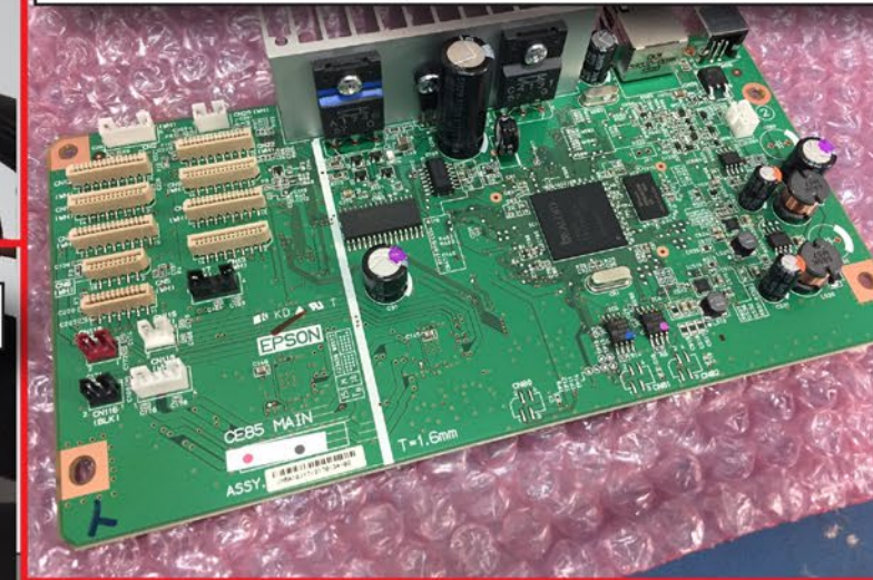
PT-DJ1800Z-MAIN | Main Board Programmed