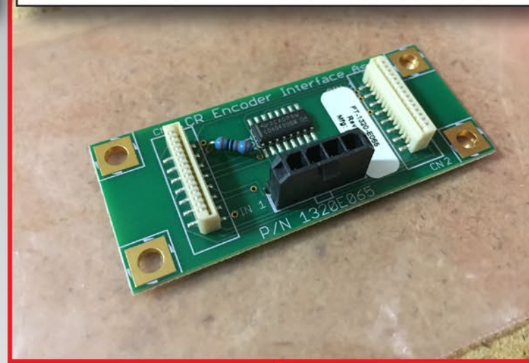
PT-A-1254 | CR Encoder Interface Board