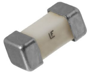
PT-1320-PE111 | Fuse, 1 AMP - EIB / F3